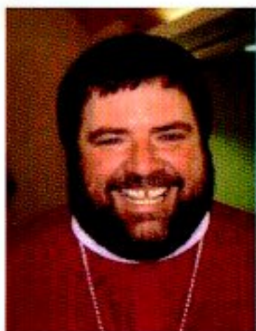
Bishop Garry Weatherill

All the work that comes under the Anglicare umbrella in Willochra is conducted by local people for local people, whether it is the provision of small interest-free loans to enable people to purchase essential whitegoods or helping frail elderly people by providing good accommodation at The Willochra Home.