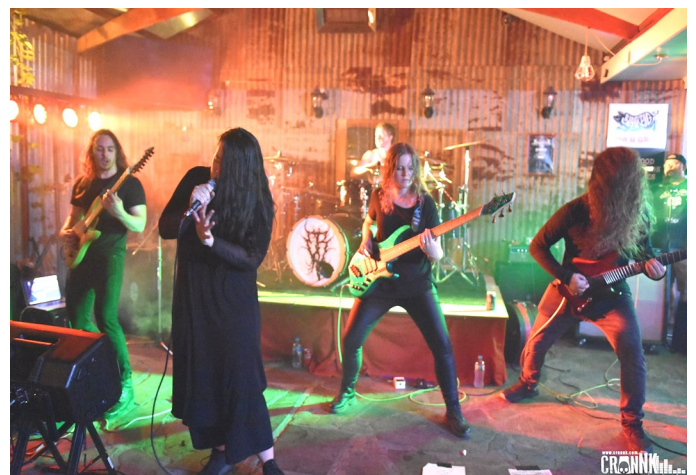
Freedom of Fear

There is nothing like seeing our favourite bands in concert or discovering bands we are unfamiliar with in a 'live' setting, so I would encourage you to get out there and see who is playing in your neck of the woods.