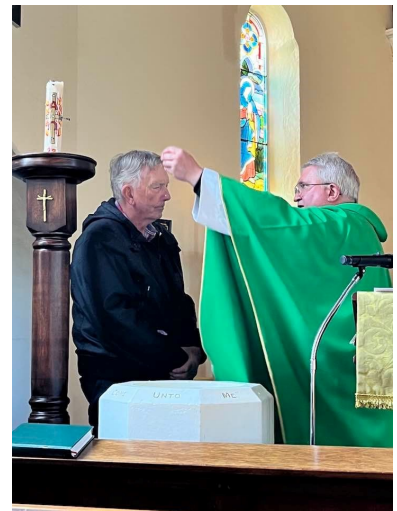
A special baptism at Holy Trinity, Riverton

We have recently welcomed several new members to our congregation and on this occasion we had a congregation of nine.