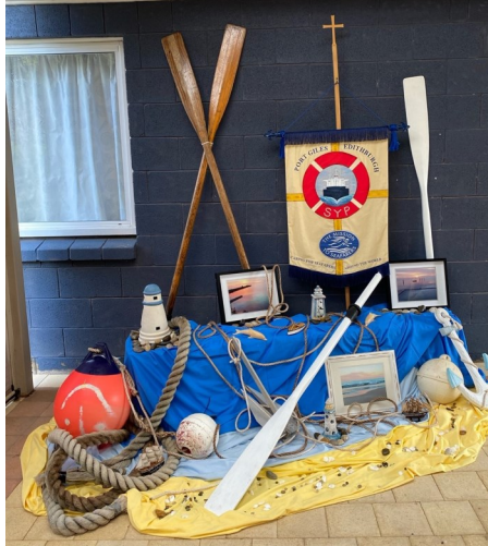
Decorated for the day

During the afternoon there was a slide show of photos from the past 10 years showing many of the seafarers who have enjoyed visiting our area while their ships have been in loading the various grains at Port Giles. This also included a short video of the planting of the tree ( Ilex Aquifolium Aurea Regina ) as part of the celebrations around the