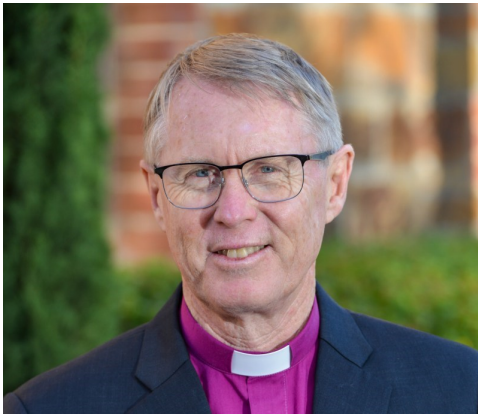
The Primate of the Anglican Church of Australia, Archbishop Geoffrey Smith.