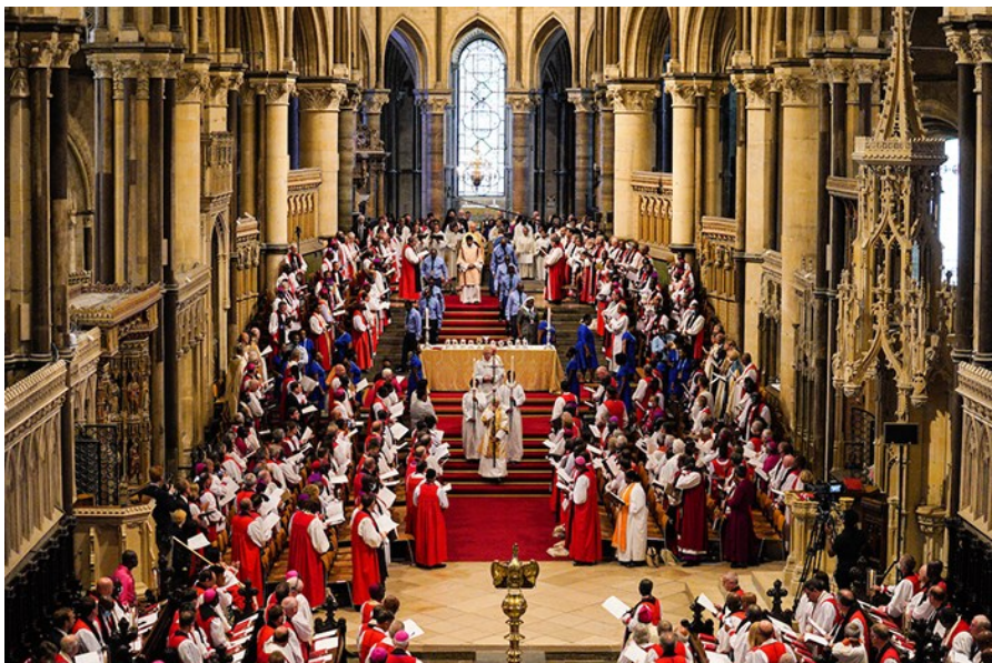
Scenes during the service as Bishops, their spouses and invited guests attend the Opening Service at Canterbury Cathedral during 2022 Lambeth in the United Kingdom.

"Because our God is a God who provides and assures us that 'those who trust in the Lord for help will find their strength renewed; they will rise on wings like eagles; they will run and not get weary; they will walk and not grow faint' .